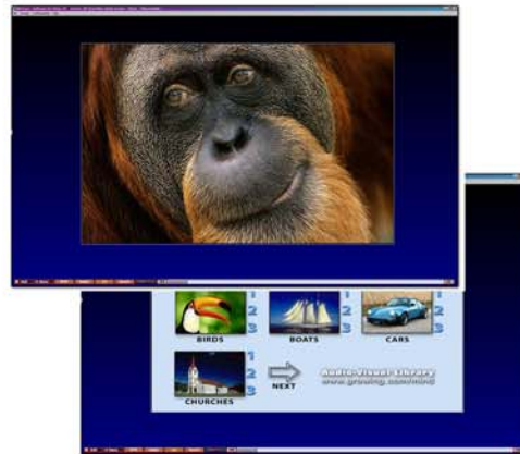
Client-side DVD feedback (NF or BF)